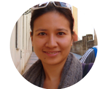
Chotiga Pattamadilok LPL, AMU & CNRS